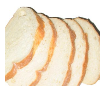
Sourdough Bread Sliced