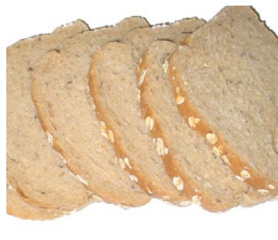
Multi Grain Bread Sliced