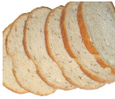
Lite Rye Bread Sliced