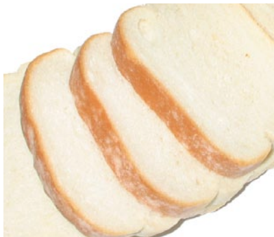
Challah Bread Sliced Thick