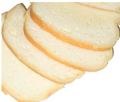
Italian Panini Bread Sliced